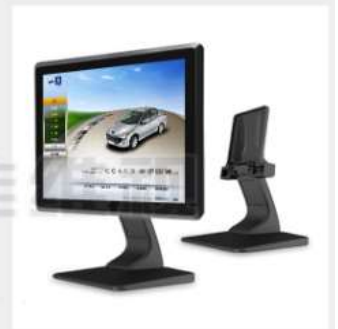
Folding Kit (Optional)