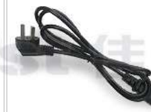
Power plug (CN/EU/UK/US/AU)