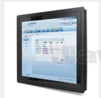
Wall mount Kit (Optional)