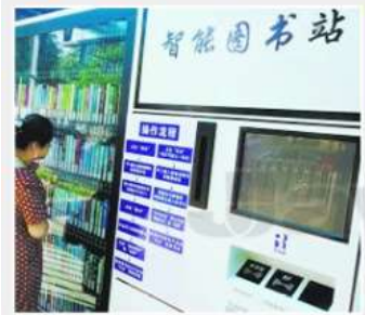
Embedded installation effect.