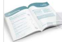
English Manual& Warranty Card