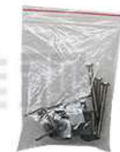
Embedded Buckle *4