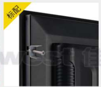
Embedded Buckle (standard)