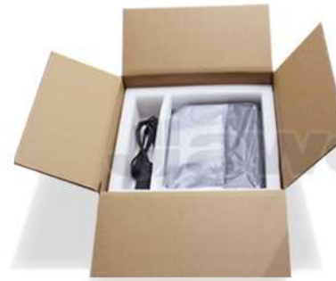
Thick foam cover&hold the product