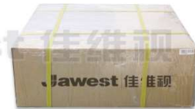
tighten up the outer packaging with plastic straps