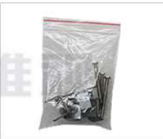
Embedded Buckle *4