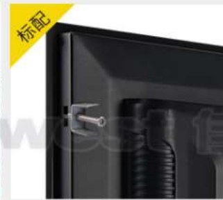
Embedded Buckle (standard)