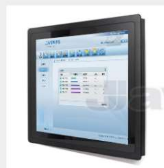
Wall mount Kit (Optional)