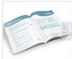
English Manual& Warranty Card