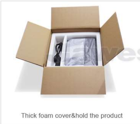
Thick foam cover&hold the product