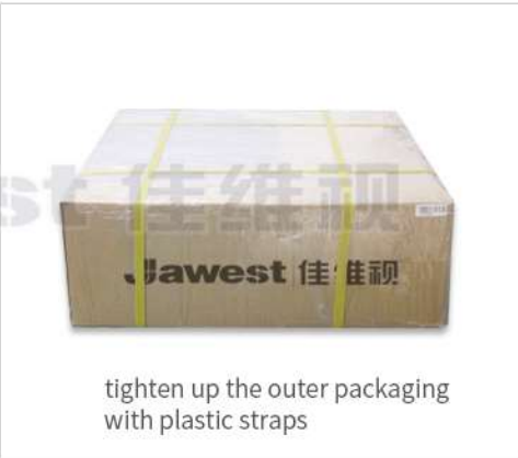
tighten up the outer packaging with plastic straps