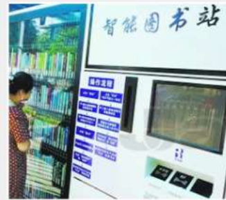
Embedded installation effect.