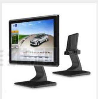
Folding Kit (Optional)