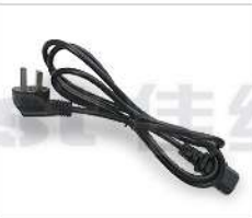
Power plug (CN/EU/UK/US/AU)